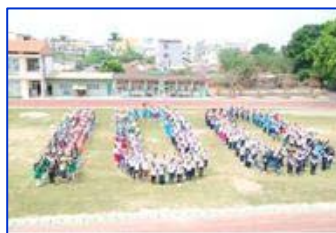
Over 500 Boy Scout and Girl Scout participants celebrated World Thinking Day in a joint

The President in her speech emphasized that the association should reach out to the community and ensure that they render service to one and all at every given opportunity.